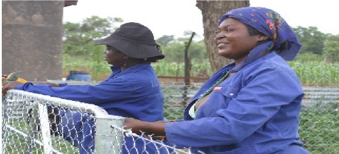
Picture 1: Muyexe Fencing Project

The researcher observed the community vegetables in Muyexe. The initiative is called MACENA, women's garden and household food security projects. The objective of this initiative is to improve food security, job creation and retention, skills development, household income generation and agricultural development. The researcher was informed that MACENA Women's group is an organised food producing group of 36 women that produce a variety of vegetables for the local community needs and also for sale.