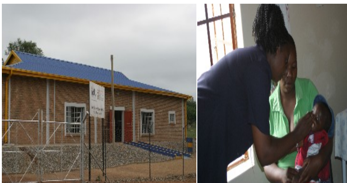
Picture 6: Muyexe multipurpose centre; Picture 7: A nurse attending to a baby in clinic

As rural development is one of the five top key priorities of government, Muyexe Village was identified amongst other pilot sites to be developed through the CRDP. Before the inception of the programme, it was evident that Muyexe lacked the most basic of necessities such as decent houses, recreational facilities, and agricultural implements. But now, the Department of Rural Development and Land Reform, through its facilitative role, has ensured that the people of Muyexe live in decent houses and have access to improved health facilities and electricity, boreholes for water as well as making better education a reality through the use of a new multipurpose centre.