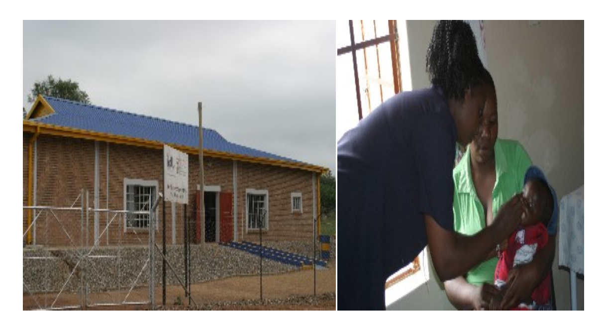
Picture 6: Muyexe multipurpose centre; Picture 7: A nurse attending to a baby in clinic

As rural development is one of the five top key priorities of government, Muyexe Village was identified amongst other pilot sites to be developed through the CRDP. Before the inception of the programme, it was evident that Muyexe lacked the most basic of necessities such as decent houses, recreational facilities, and agricultural implements. But now, the Department of Rural Development and Land Reform, through its facilitative role, has ensured that the people of Muyexe live in decent houses and have access to improved health facilities and electricity, boreholes for water as well as making better education a reality through the use of a new multipurpose centre.