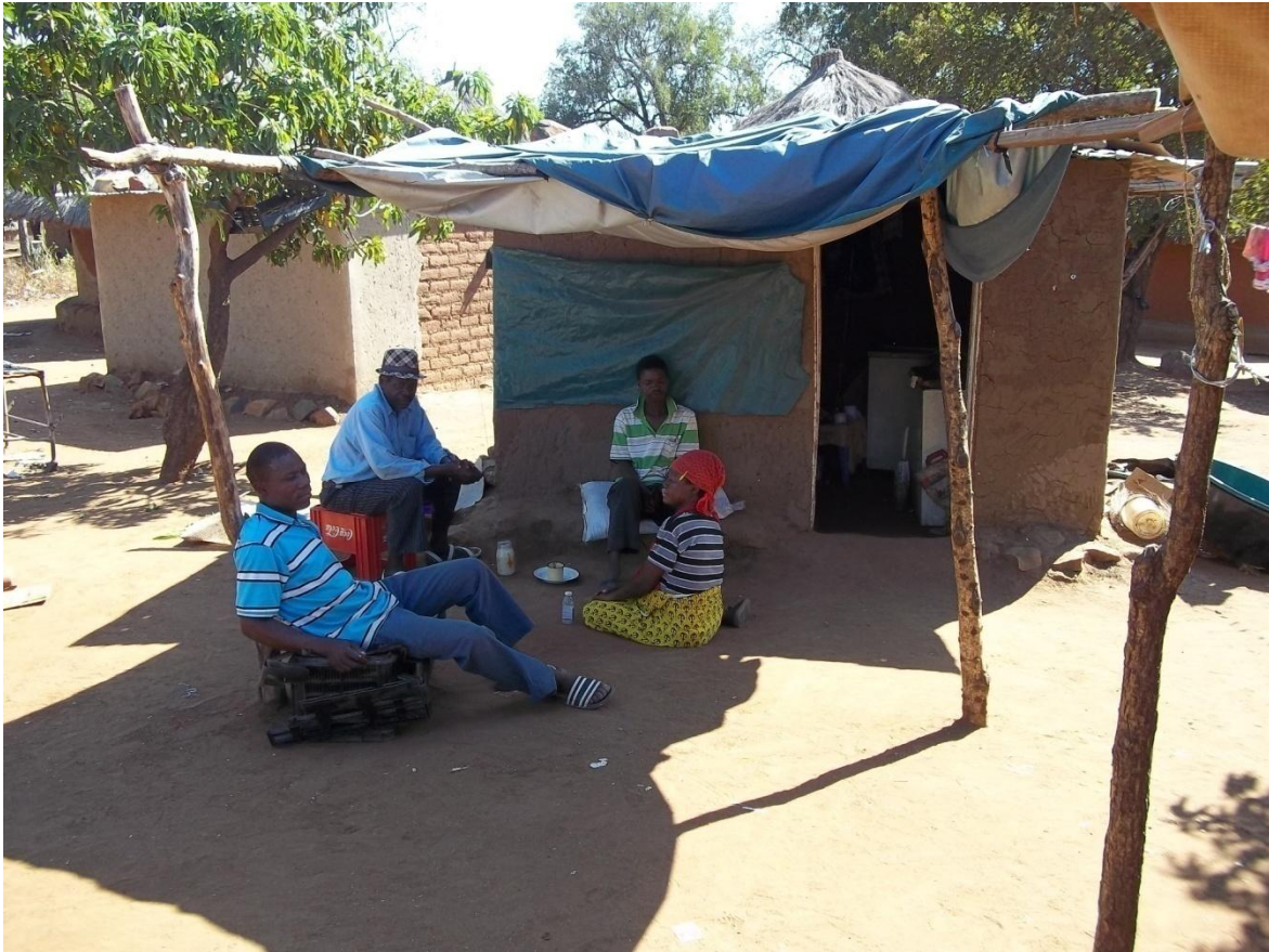
Picture 3, People drinking home-brewed beer. ( source: primary research)

The picture 4 below indicates the spaza shop from which the community buys. The only stock they have is what is seen in the picture. Again it explains the quality of the food they eat. It also indicates the income level of the community, because if the majority of the community members were working, their shop would be better than the one they are having now.