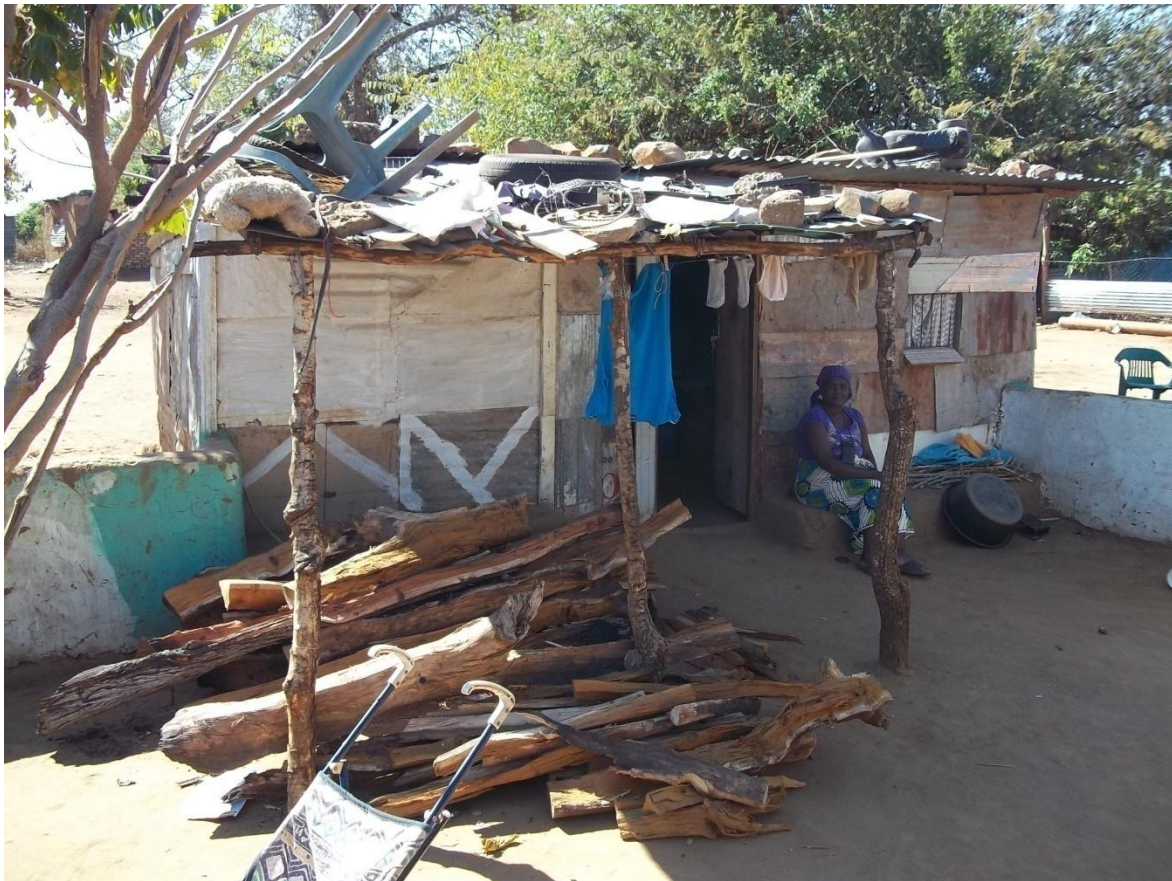
Picture 1: Makeshift shack and wood gathered for fire

The picture 2 below also indicates the kind of houses that people live in. There are two houses, and the one with a door is the main house which the family use for keeping their belongings and which is also the bed room. The other one is the kitchen, which is used for cooking and lounging. It is clear from the picture that this is a poverty stricken family. The picture tells it all, that there is little income in the family and according to them; the two houses are the only property they have.