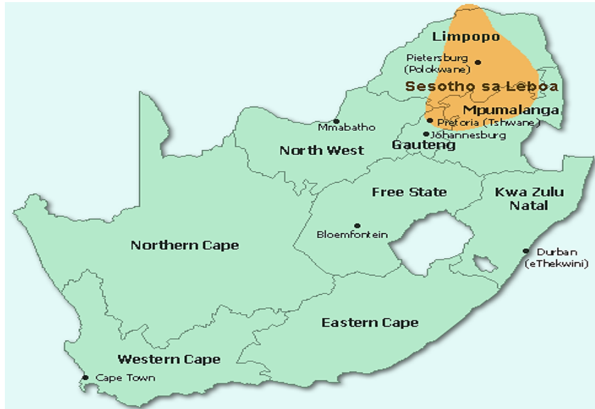
Figure 1. A map showing the approximate geographical area of South Africa where SeSotho sa Leboa (Northern Sotho) is spoken. The area is indicated in brown.