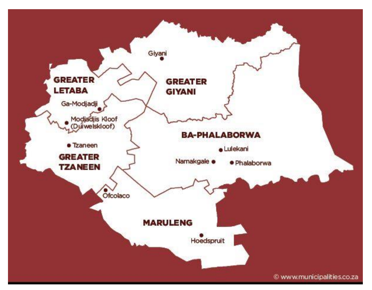
Figure 3.1 Map of Mopani District Municipality showing local municipalities (Local government handbooks 2016).

area practice farming. Culture in this area is valued and respected by people. Cultural practices, such as traditional healers and spiritual healers, are respected in this area.