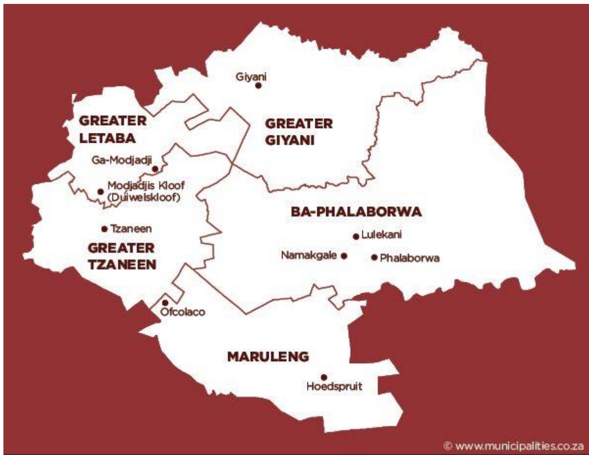
Figure 3.1 Map of Mopani District Municipality showing local municipalities (Local government handbooks 2016).

area practice farming. Culture in this area is valued and respected by people. Cultural practices, such as traditional healers and spiritual healers, are respected in this area.