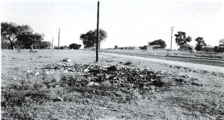
Plate 2. Waste dumped along the R40 roadside by residents of Beverly Hills

All the household waste collected by the municipality is disposed of at a disposal site situated 300 metres on the northern side of Thulamahashe Central. Solid household waste such as plastics, papers, bottles, tins, motor tyres, metals and rubber, hazardous waste such as motor oils, acids and medical waste such as used