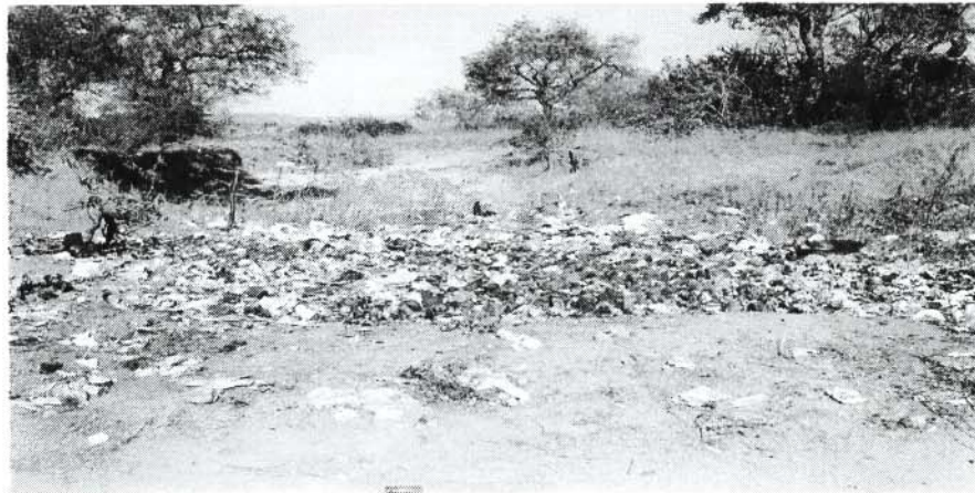
Plate1. Waste dumped on open land on the outskirts of Thulamahashe Extension.

In Beverly Hills, where waste is collected for disposal once in two weeks, some residents in the area dispose of their household waste