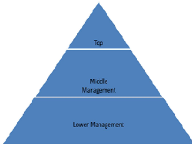
Figure 1. Three level of management