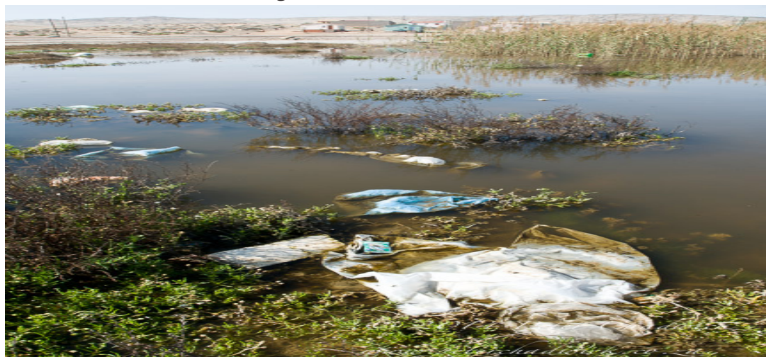
Figure 1: Polluted Wetlands