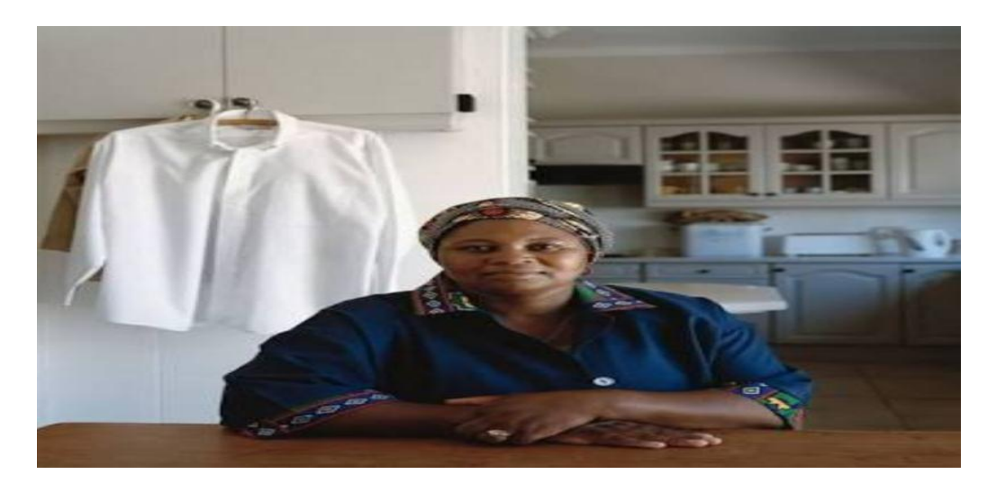
Figure 4. 3 Domestic Work

Figure 4. 2 Civil Servant