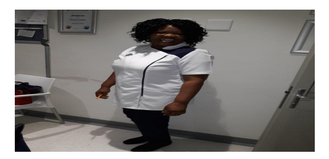
Figure 4. 2 Civil Servant