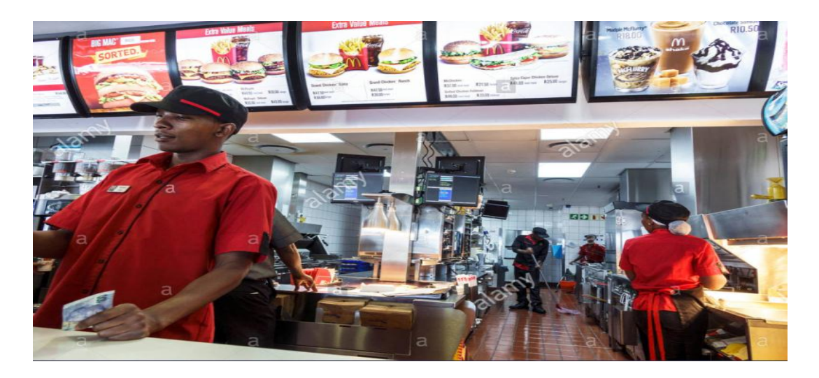
Figure 4. 7 Fast Food Outlets