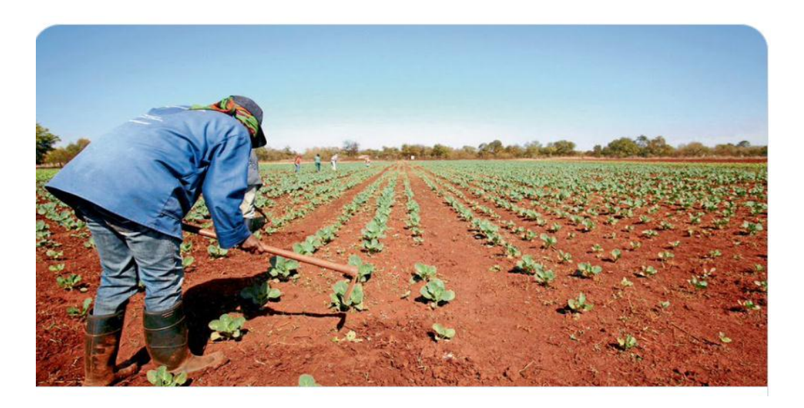
Figure 4.1 Farming

The figures below show the different livelihood diversification activities harnessed by rural households in Capricorn District.