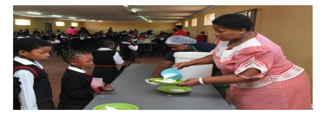
Figure 4. 4 School cook