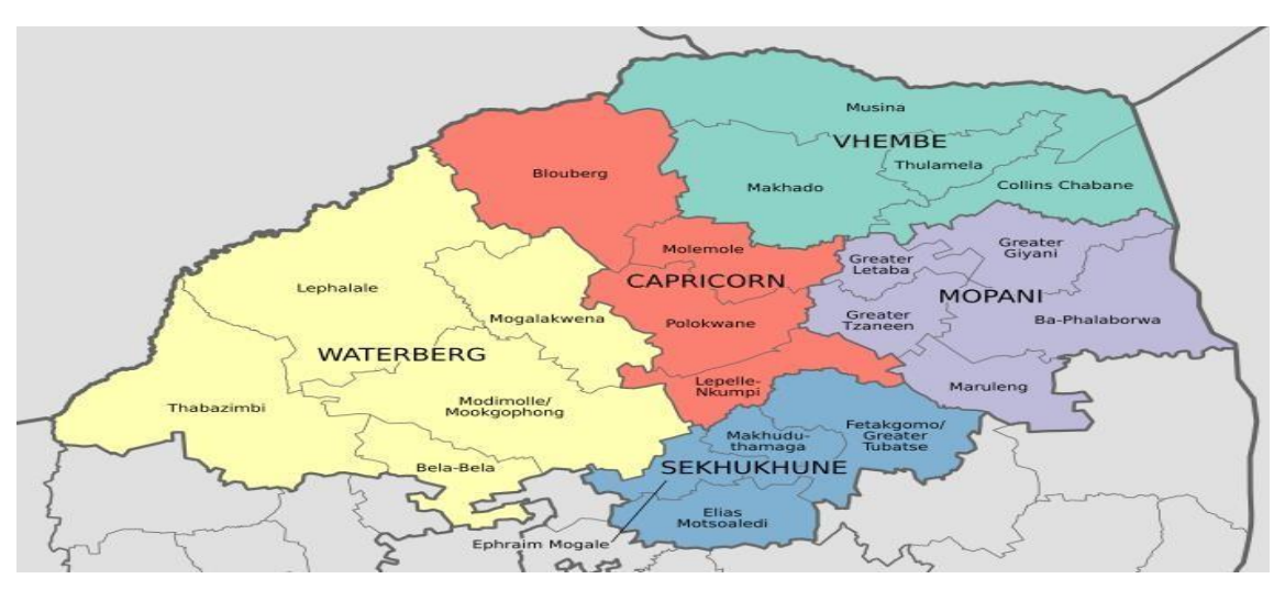
Figure 3.1: Map of Limpopo province showing Limpopo Districts and Sub Districts

Figure 3.1 above, shows the map of Limpopo province indicating Limpopo District and Sub-district. The study was conducted in Waterberg district.