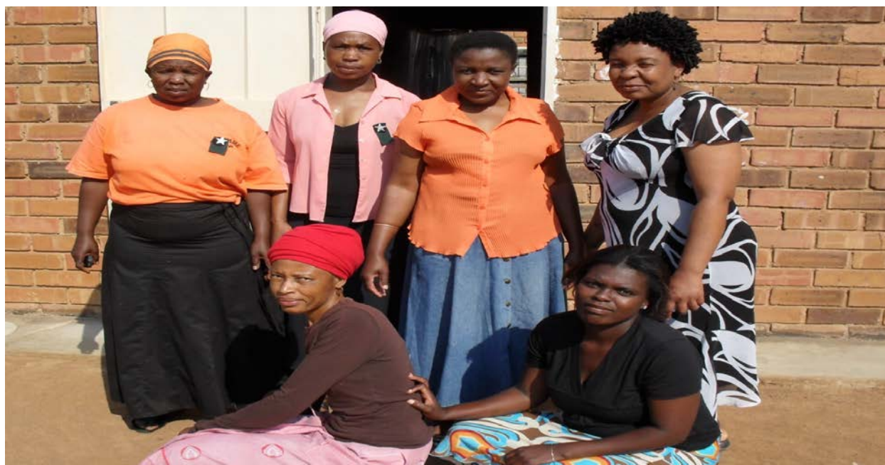
Figure 4: Below; shows some of the caregivers at Phuthanang home based care.

According to Ogden and Esim (2003) about 90% of AIDS care takes place in the home and women bear a disproportionate burden of those responsibilities. Findings from this study confirmed that many caregivers were poor, had no source of income, and therefore were not able to afford what their clients required or demanded. The caregivers in this project are Volunteers who do not receive any stipends for their work. This lack of income discourages men from offering their services to this particular project, and explains why all caregivers are women.