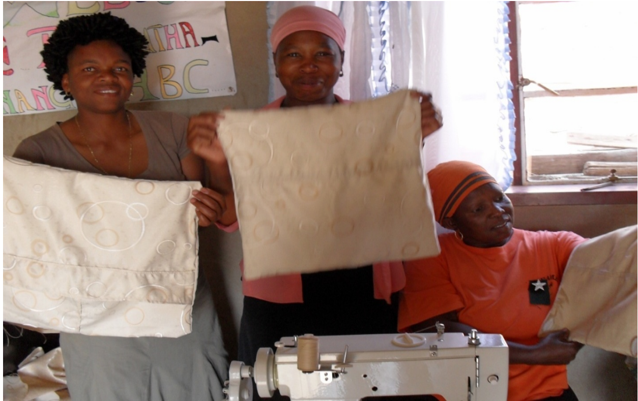
Figure 6: Caregivers displaying some of their sewing products