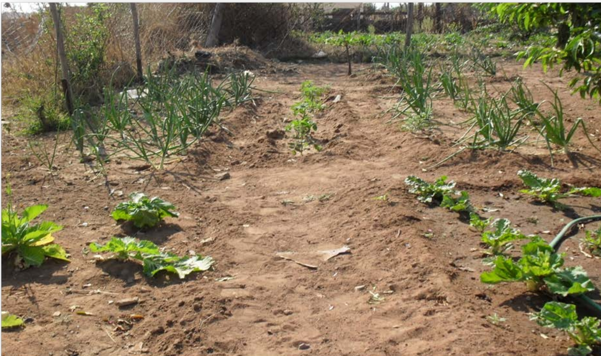
Figure 5: Showing vegetable garden at Phuthanang Home Based Care

Caregivers at Phuthanang Home Based Care help their clients in starting home gardens to help improve their nutrition requirements. They also train community members on how to grow vegetables and cook nutritious food. This project though it was well received by community members; is failing to meet its goals because of limited space, seedlings and manure.