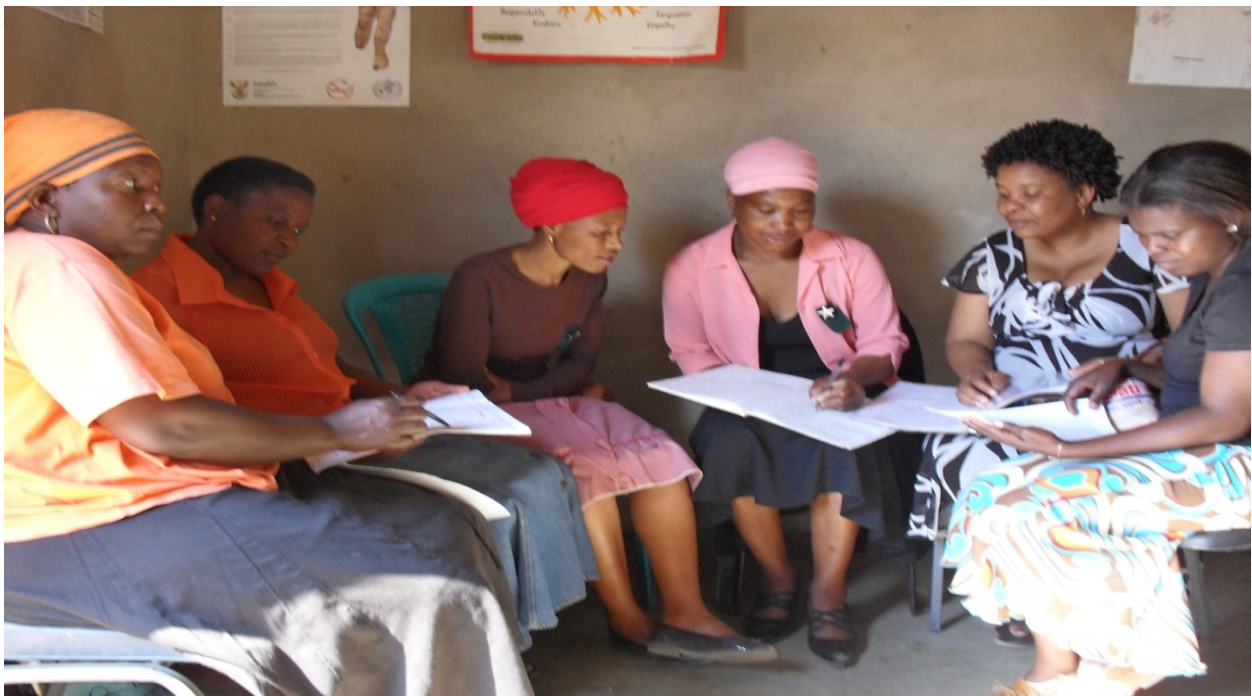
Figure 2: Photograph showing a focus group interview at Phuthanang home based care

There was one group for this discussion, in 45 minutes the group discussed the challenges faced by Phuthanang Home Based Care in providing care and training. The dialogue for the focus group interview was organised around major themes in an attempt to answer the main research question. All the participants were given room to express themselves in the discussion. I assumed the position of a facilitator during the focus group interview, driving the discussion and making sure that all the people present had a chance to speak out their minds without being overshadowed by the extroverts.