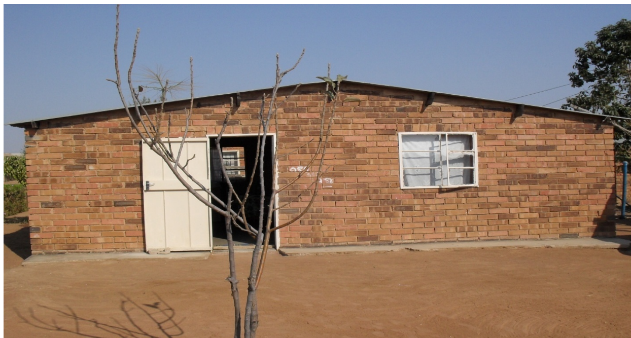
Figure 3: Below shows Phuthanang home based care office building.